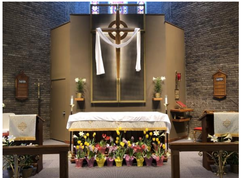
Above: The altar decorated with Easter flowers. Below: Individual candles are lit during Easter Vigil.